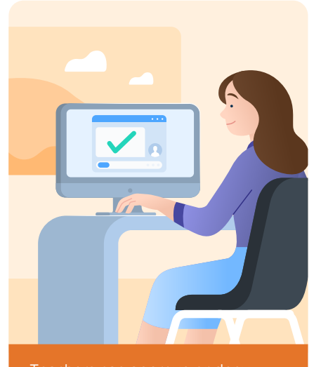
eachers can approve or deny passes in seconds, without lisrupting their lesson.

School administrators can pull custom reports for pass takers, pass granters, and more to immediately know what students are going where, and how frequently.